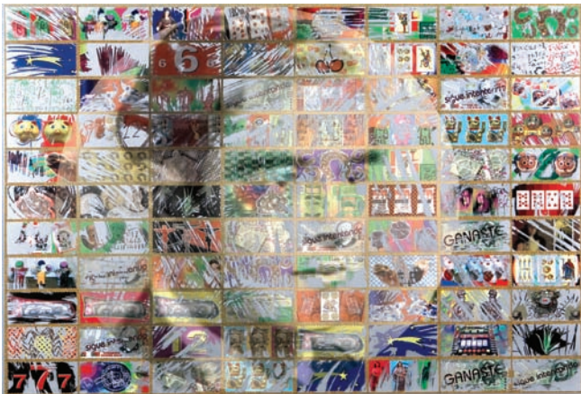
Rocío Rendón Castañeda (Perú, b. 1972) Gran raspa de la serie Raspa y gana estampa lúdica en liquidación / The Great Scratcher from the series Scratch and Win, Recreational Series in Liquidation , 2007 xerograph silkscreened on wood, 31 ½ x 47 ¼ x 1 ½ in. Gift of the artist

The award winning drawing, Casa de Casas (House of Houses), is a delicately layered drawing that emphasizes the fragile and transitional nature of the physical constructed world. Created with sumi-ink on parchment paper pressed between glass the artist's intent is to create a dialogue between the materials (the multiple layers of papers) that make the drawn image of a dwelling vibrate in the blank landscape. The work is like a document of information about a particular place, rendering it as a ghostly apparition of its original form.